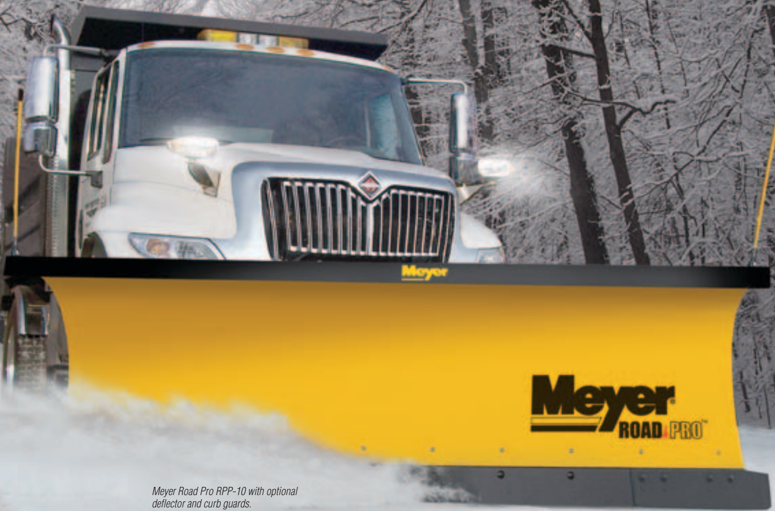
Meyer Road Pro RPP-10 with optional deflector and curb guards.